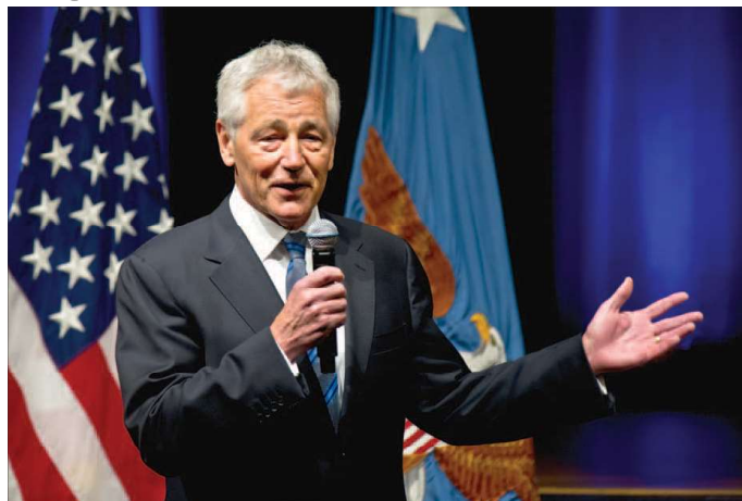
CHUCK HAGEL , former U.S. Secretary of Defense, will deliver the keynote address at this year's conference hosted by the American Polish Advisory Council.

WASHINGTON, D.C. — The American Polish Advisory Council (APAC), a Washington-based nonprofit, bi-partisan organization with a mission to politically engage Polish Americans, announced that former U.S. Secretary of Defense, the Honorable Chuck Hagel will be the keynote speaker at this year's Polish American Conference.