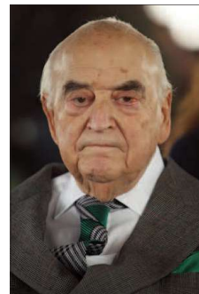
Lord George Weidenfeld

He established the Weidenfeld Safé Havens Fund,